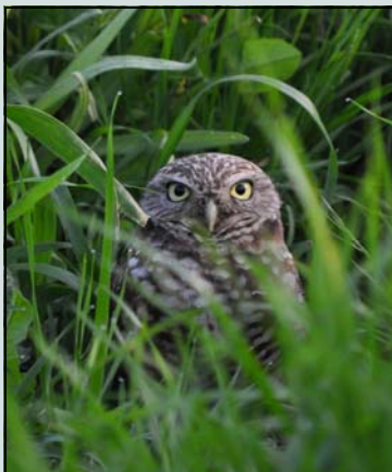
Burrowing Owl.

Stop by and visit our exhibit! Pick up posters with scenes of landscape and wildlife in Yolo County, as well as packets of seeds for native wildflowers!