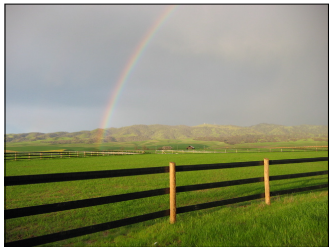
View of Capay Hills from Hungry Hollow.

In addition to undertaking voluntary actions to meet the objectives of these goals, the HHW Stakeholders Group is developing a short-term action plan for accomplishing these goals. Proposed projects include a watershed assessment to implement creek and channel bank stabilization projects and seeking support for flood mitigation, wildlife corridor enhancement, and invasive species management. A trash removal and stream bank stabilization project