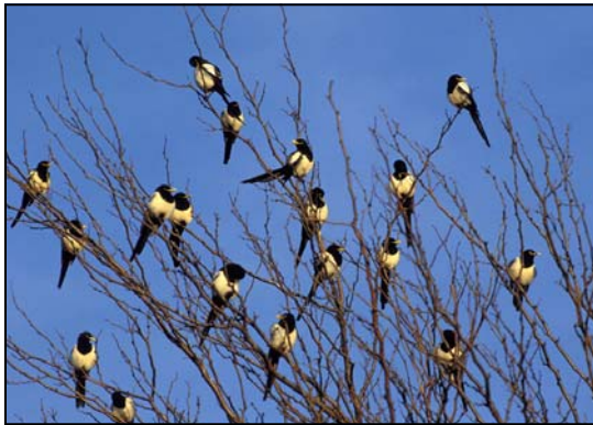
Yellow-billed Magpies roosting near Bradley in Monterey County, CA..

Most of us can agree that the Yellow-billed Magpie is one of California's most striking and popular native birds, but did you know that the species is only found in California? Populations are concentrated in the Sacramento and San Joaquin valleys and adjacent low foothills. The Yellow-billed Magpie, named the 2009 Bird of the Year in an online poll conducted by Audubon California, is at risk due to habitat loss,