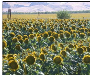
Sunflowers and safflowers along County Rd 85 near County Rd 16.

Hills feed the watershed during the rainy season, along with the Hungry Hollow Canal and the West